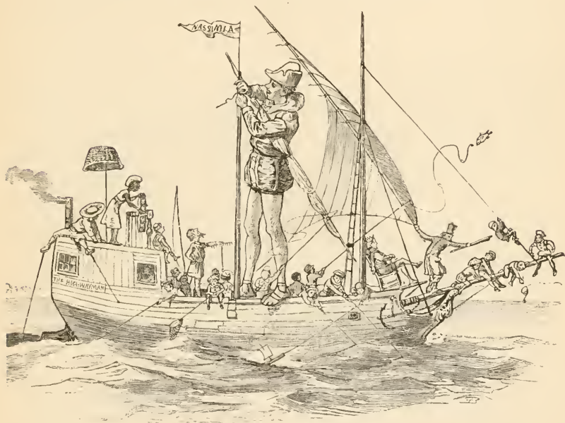
THE KINGDOM OF NASSIMIA AFLOAT.

WITH ILLUSTRATIONS BY BENSELL AND OTHERS.